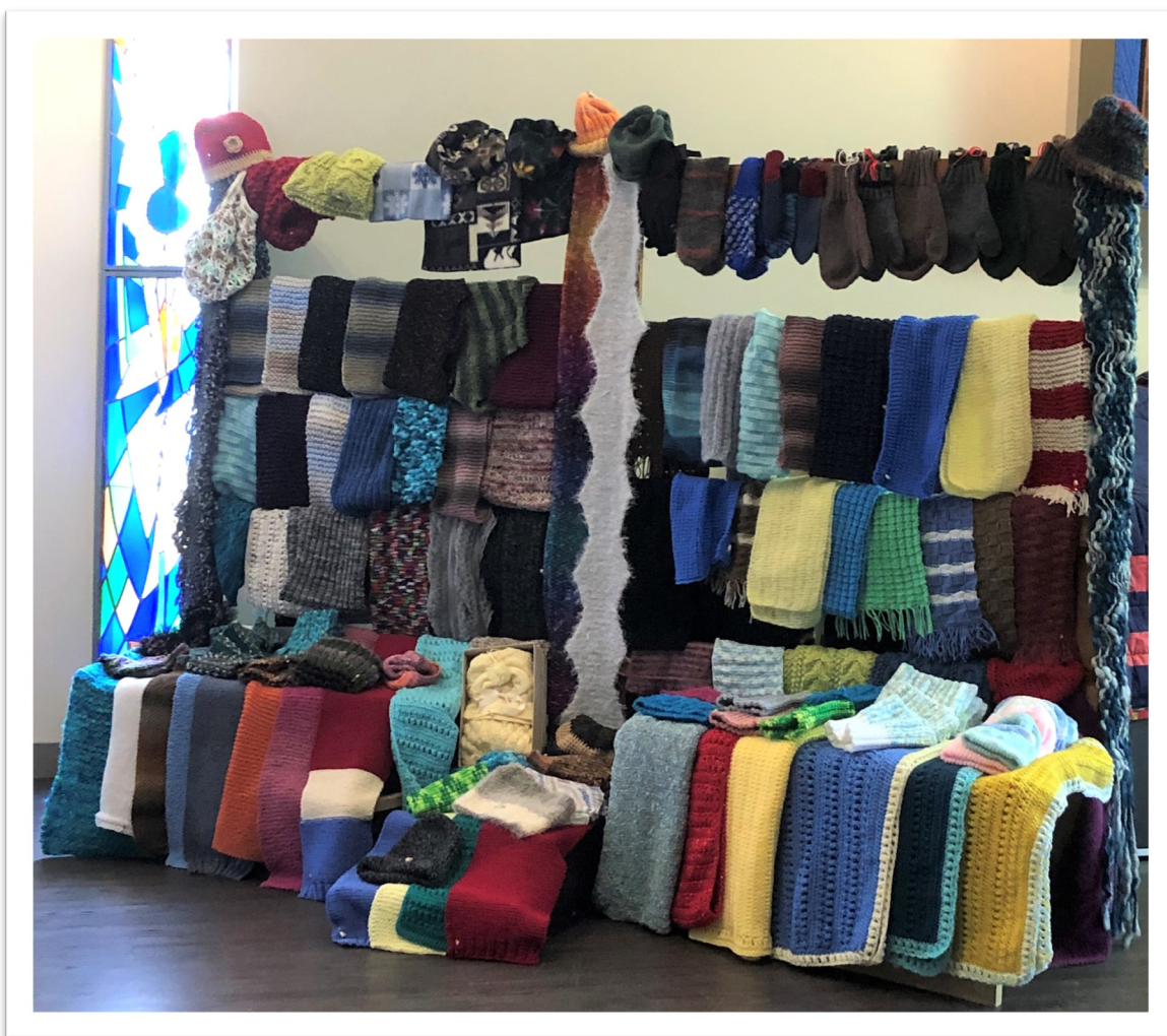
Knitting Display in Sanctuary