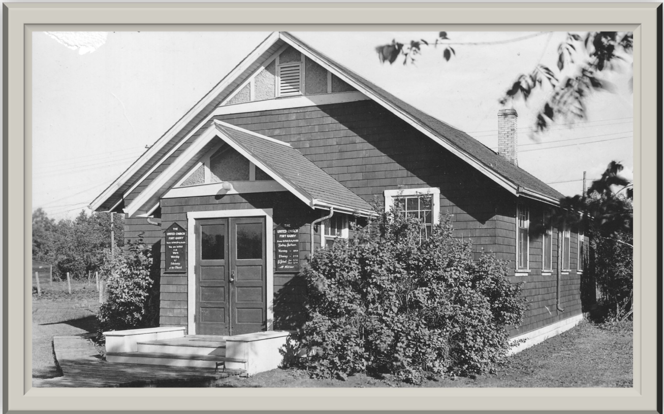
FGUC North Drive 1936